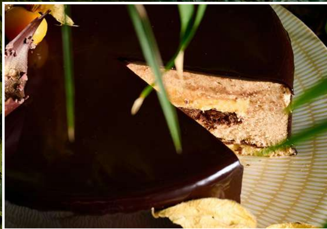
Citrus & Chocolate (N)(E)(D)

A wonderfully light coconut caramel crumble layered with a mango mousse and topped with a tropical mango lemon jelly.