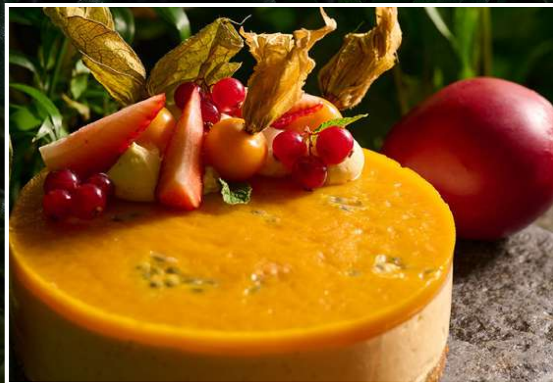
Tropical Cheesecake (D)(E)

Whether it's a birthday, anniversary, graduation or simply 'because' complete your special occasion with a memorable celebration cake. Our expert pastry chefs have designed a range of tropical and Latin American inspired options guaranteed to put a smile on everyone's face.