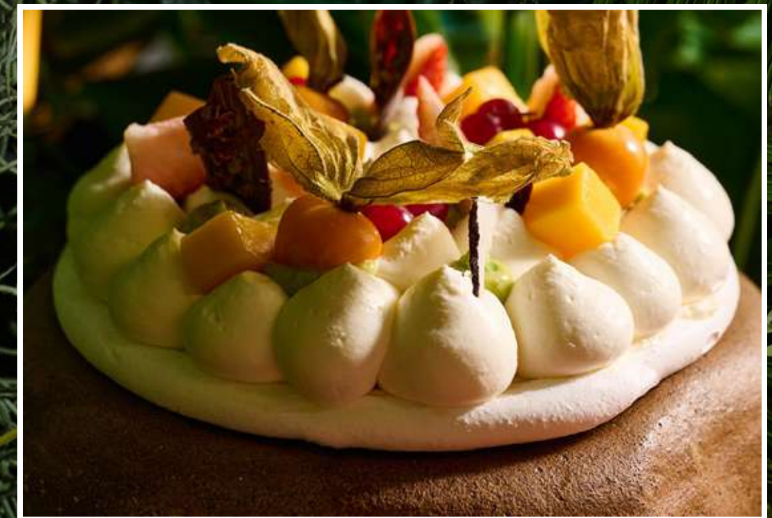
Exotic Pavlova (D)(E)(C)

On a rich almond cake base, the delicate hazelnut praline mousse is filled with a smooth lemon crèmeaux and crispy dark chocolate feuilletine centre and decorated with a dark chocolate glaze.